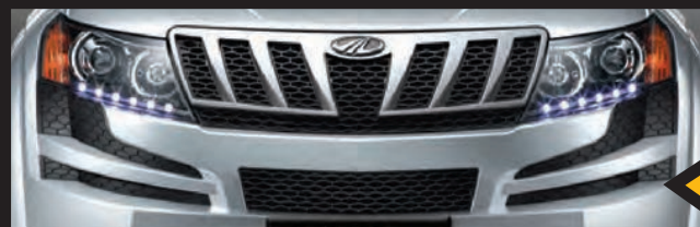
JAW-LIKE FRONT GRILLE