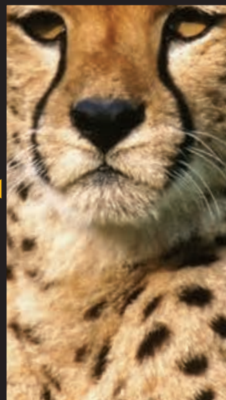
POUNCING CHEETAH-INSPIRED BODY LINES